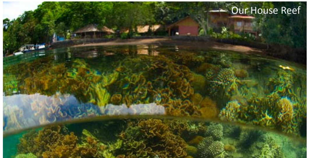
Our House Reef

We have started to introduce many small improvements around the resort to improve the already outstanding customer service that returning guests have come to expect from NAD. We have a few plans up our sleeves to offer a few more services to future guests. Top of the list is an all new camera room, charging facility, and computer editing centre. Our aim is to create the finest underwater photography resort in Lembeh. With the advantage of having two professional underwater photographers on location, interested divers will be offered classes and tips at all times of the day all year round, few other resort in Lembeh can match this service.